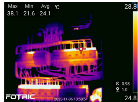
40mk thermal sensitivity reveal every anomaly