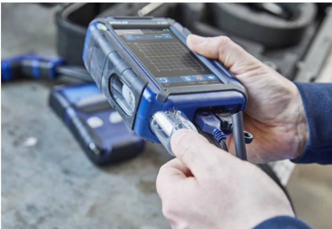
Easy access to condensate trap and filters.