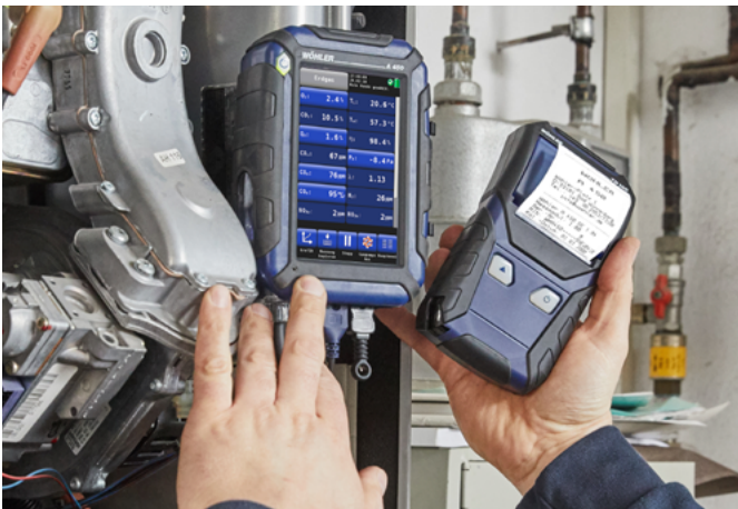
Printout of the measured data on site.