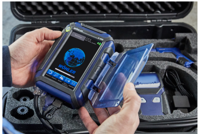
Sturdy and enclosed in a case.