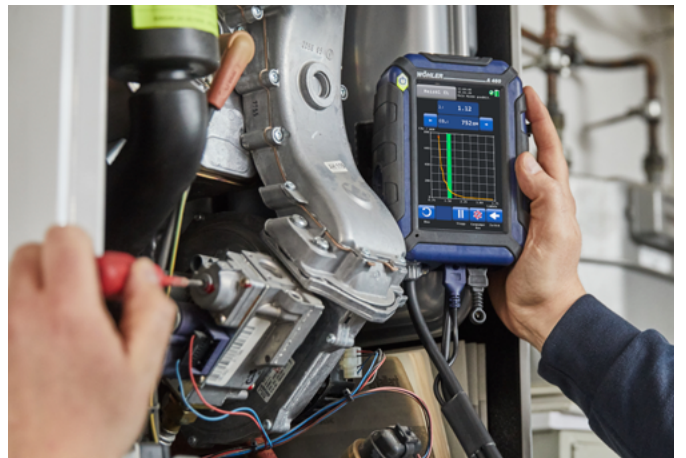
The tuning guide offers an advanced guidance to properly adjust the burner.