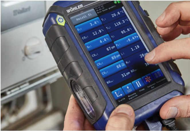
All measured values available at a glance with high-resolution display.