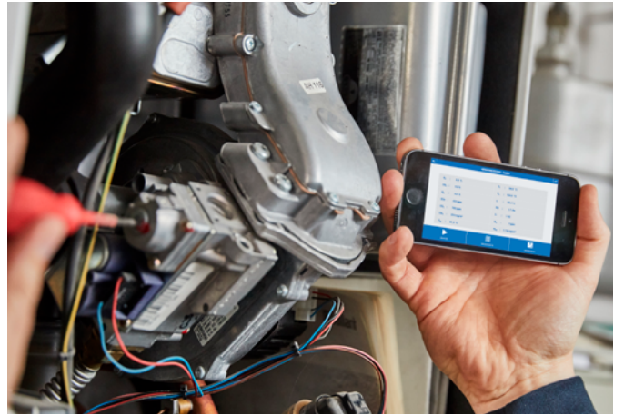
Wöhler A 450 app: Displaying the measured data on a mobile device.