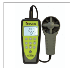
DC580C2 with vane probe