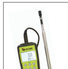
DC580C1 w/ hot-wire probe