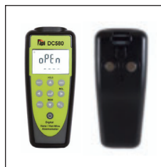
DC580 front and back