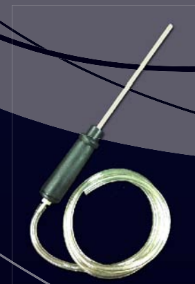
Extension probe is useful for hard-to-reach sampling points