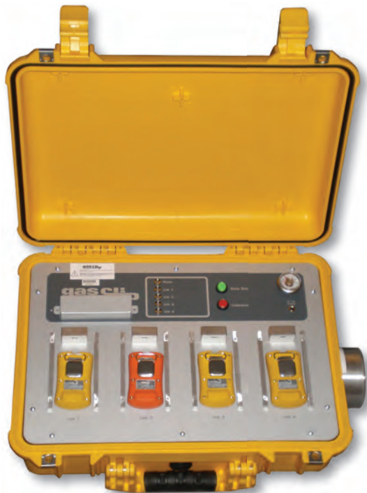
"Clip Dock" Docking Station