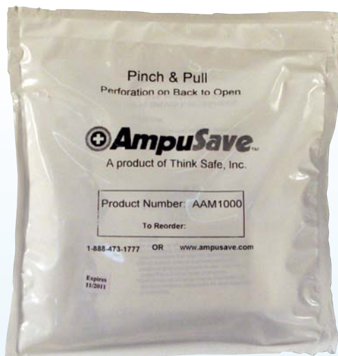
8.5" x 7.5" x 1" bag at 11 ounces

AmpuSave is a medical transport device that allows for proper storage and transport of severed digits and avulsions. AmpuSave consists of a storage compartment for a cold compress (which is included and sealed) and another storage compartment for gauze, saline solution, and an instruction card for proper preparation, as well as the necessary storage of the amputated digit or avulsion for transport. The included instruction card allows for recording the time of the injury and the injured party's name for accurate reporting of the incident.