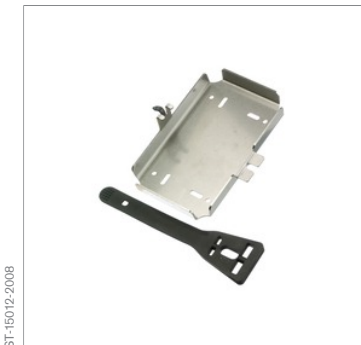
Vehicle charger mounting kit