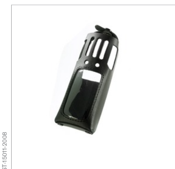
Leather carrying case