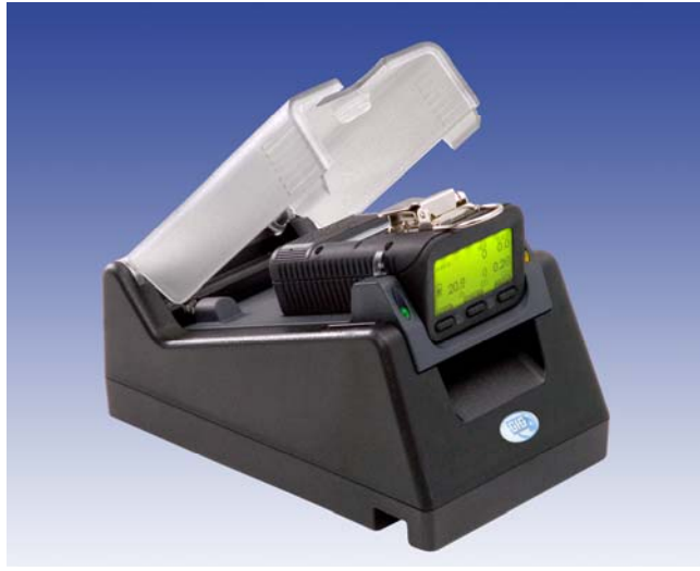
Automatic “docking stations” make calibration and record keeping completely automatic

Most manufacturers now offer automatic calibration or “docking” stations that can automatically calibrate, recharge and store instrument calibration records. The availability – and price point – of automatic calibration stations can have a significant effect on both the usability as well as cost-of-ownership of the instrument over the life of the product. Make sure to find out about the availability – and cost – of calibration and docking stations before rather than after you purchase the equipment.