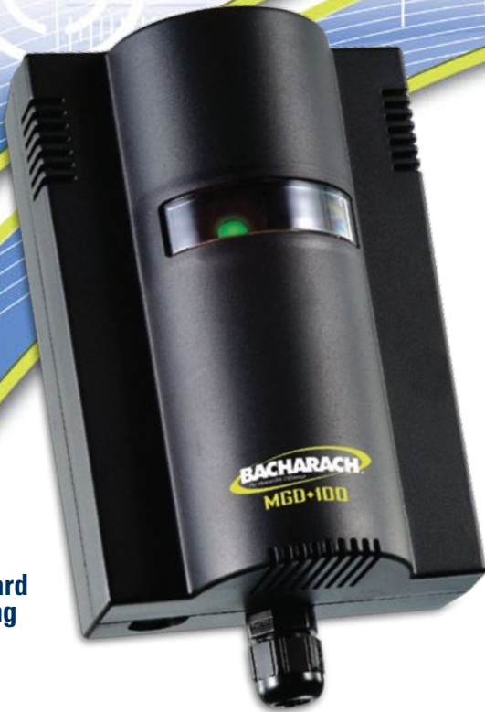
MGD Standard Housing

Ideal for Chiller Rooms, Supermarkets, Brewing and Bottling Facilities, Industrial Refrigeration, Arenas, Food Storage and Processing Facilities.