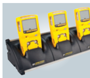
Five unit cradle charger

For a complete list of kits and accessories, please contact BW Technologies by Honeywell.