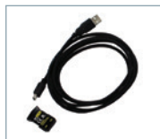
IR connectivity kit